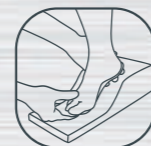
DIRECT ADAPTATION IN NEUTRAL POSITION