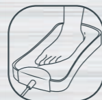
DIRECT ADAPTATION IN CORRECTED POSITION