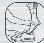
DIRECT ADAPTATION IN DYNAMICS